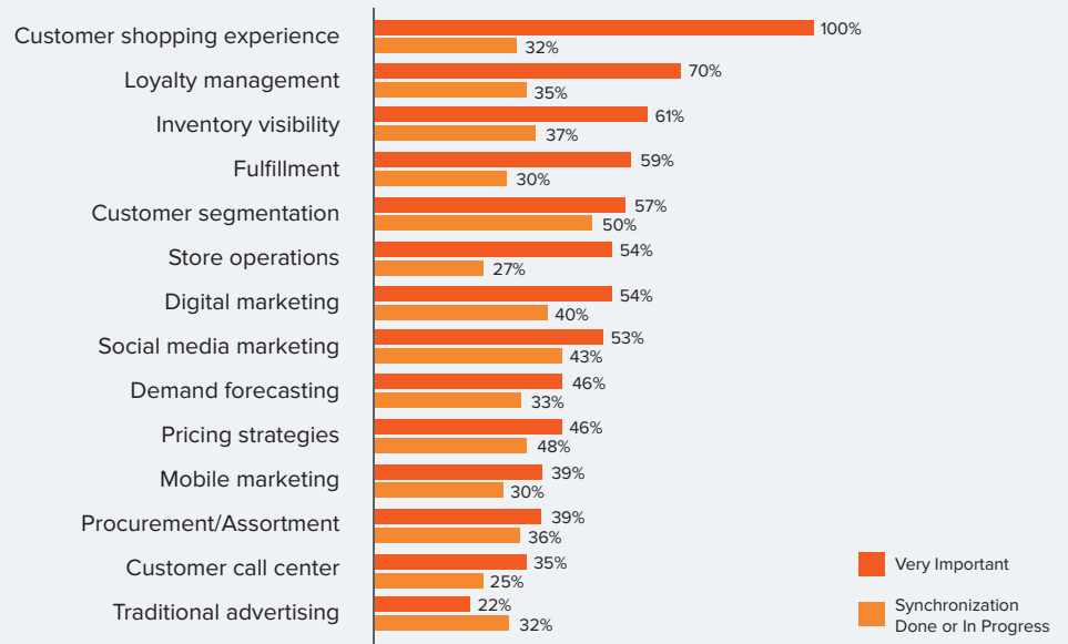
Figure 2: Focus, Yes. Progress, Not So Much