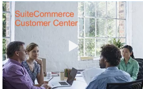
NetSuite SuiteCommerce Customer Center Webinar